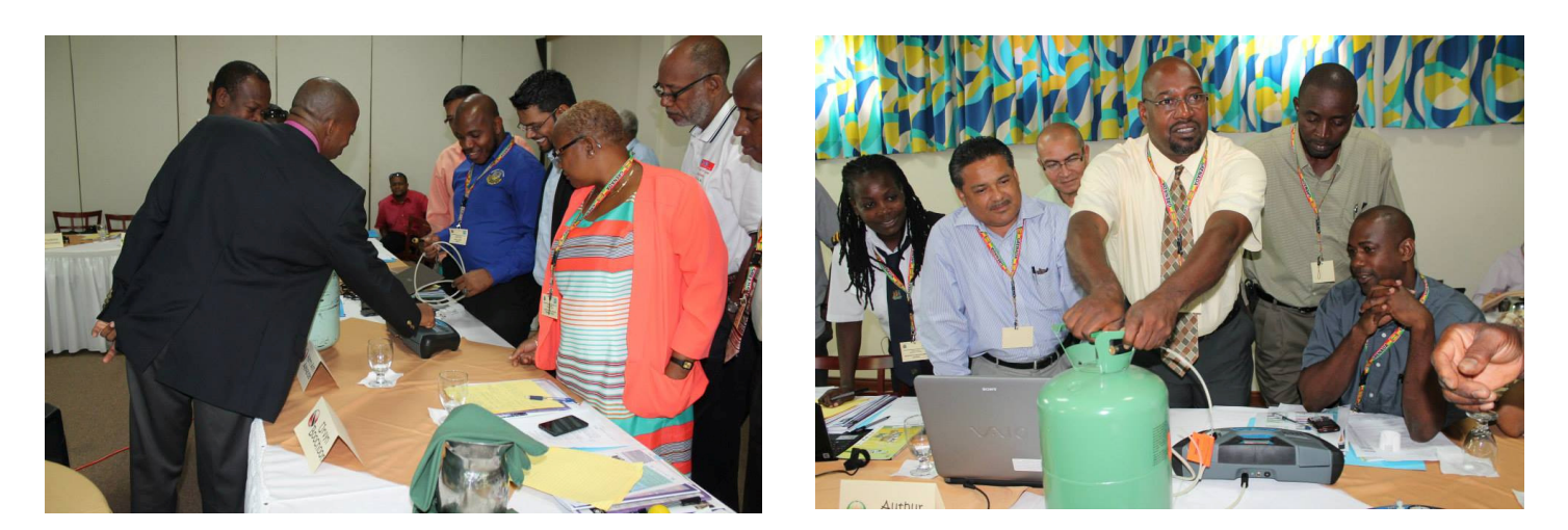
Please Visit our facebook page to view additional photos.( www.facebook.com/nou.grenada)