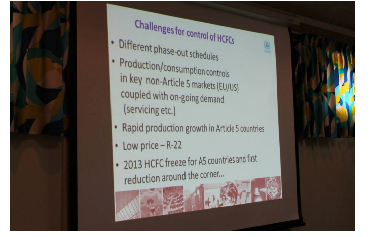
Please Visit our facebook page to view additional photos.( www.facebook.com/nou.grenada)